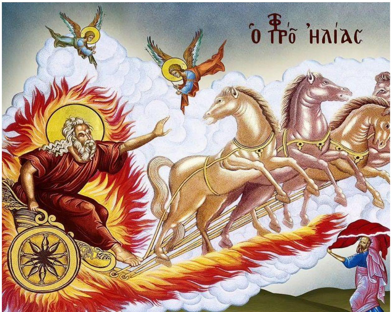
St Elijah the Prophet Sv Prorok Ilija

A quarterly publication of St. George Serbian Orthodox Church in Joliet Тромесечно издање Српске Православне Цркве Св. Георгија у Цолијету 300 Stryker Avenue, Joliet, Illinois 60436 Тел/Phone: (815) 741-1023 www.stgeorgejoliet.org Факс/Fax: (815) 741-1883